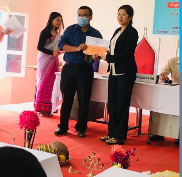
Prize Distribution of District Level Inter College