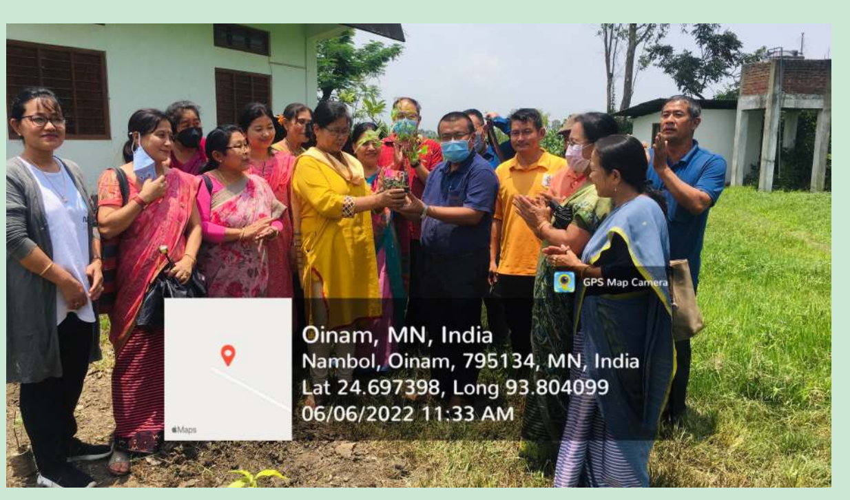
World Environment Day Observation